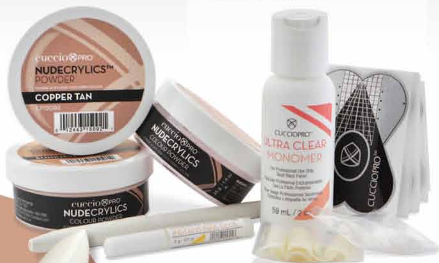
Nudecrylics Kit CP15089