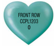
Energetic blue crème