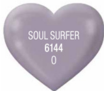
Soft lilac purple