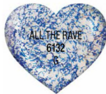
Blue & White Confetti Glitter