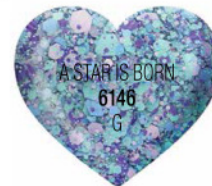
Multi particle sizes of matte glitter sequin of light purple, baby blue, violet & sea foam green pieces