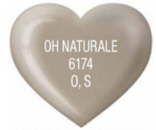
Taupe with silver shimmer