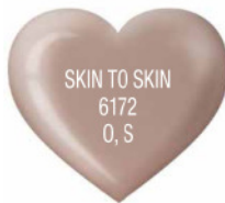
Light tan with a nude shimmer