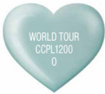
Soft baby blue