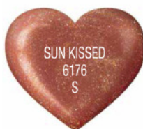
Medium tan with gold shimmer