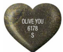
Gray with gold shimmer & green undertones