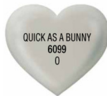
Creamy pastel grey