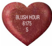
Salmon pink with gold shimmer