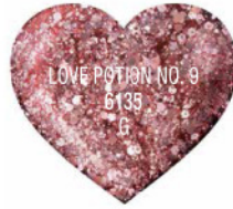
Baby pink glitter