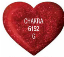
Deep intense red glitter