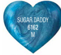
Brilliant, metallic blue