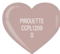
Warm nude crème