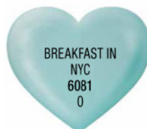
Traditional Robins Egg Blue