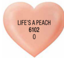
Creamy pastel peach