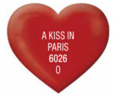
Traditional red with warm tone