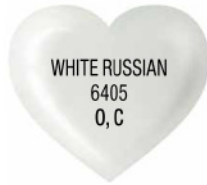
Creamy bright white