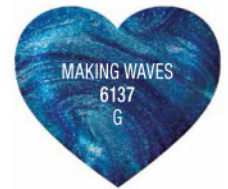
Aqua blue shimmer