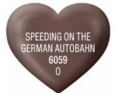
Brown with warm undertone