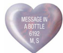
Purple with metallic pink shimmer