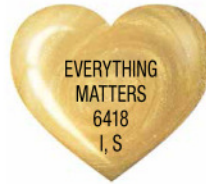
Rich yellow / gold