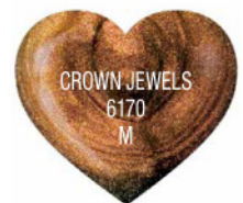
Gold copper with metallic green undertones