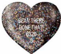
Multi fleck glitter