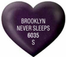
Deep purple with medium purple shimmer