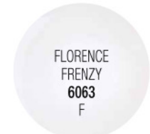
Traditional white for French manicure