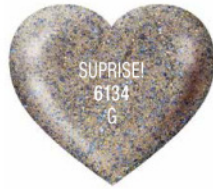
Gold & Silver glitter with blue glitter flecks