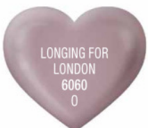
Pale violet with gray undertone