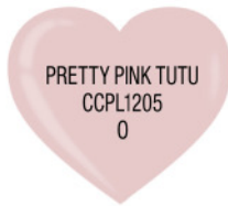
Pastel pink crème