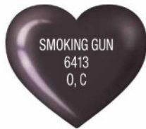
Deep taupe purple