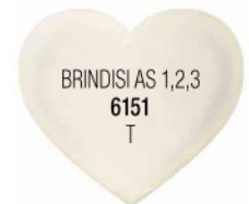
Creamy translucent white (sheer)