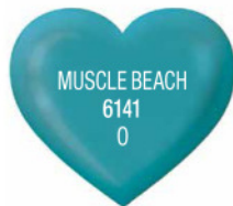
Deep cyan, dark bluish-green