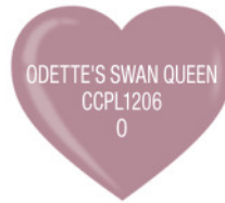
Soft violet crème