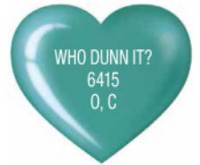
Sage creamy green