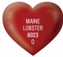
Cool tone red