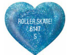
Blue shimmer with crystal mica