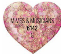
Multi particle sizes of matte glitter sequin of yellow, cream, pink & light pink pieces