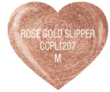
Rose gold metallic