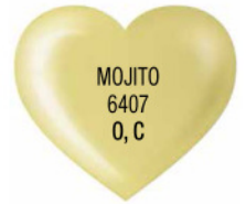
Creamy bright yellow