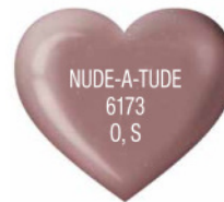
Medium Tan with pink base and nude shimmer