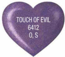
Purple with silver shimmer