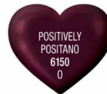
Rich burgundy wine