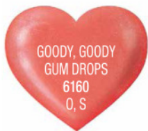
Coral orange shimmer