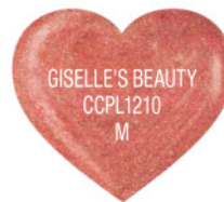
Soft pink metallic