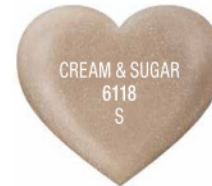
Taupe with silver mica glitter