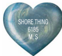
Light baby blue with a gold metallic shimmer