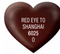
Dark red with a blue base