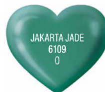
Rich kelly green