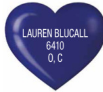
Creamy ink blue