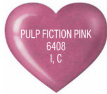
Dusty rose with a pink iridescence