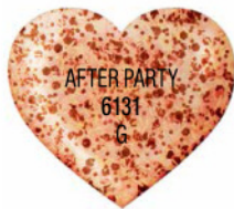
Orange confetti & glitter