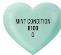
Creamy pistachio mint green