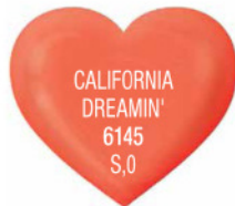
Orange/red with a soft shimmer