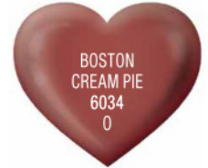
Brown with pink undertone