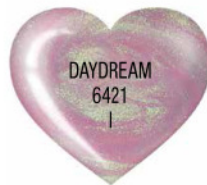
Iridescent purple / green