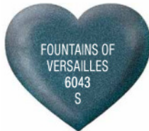
Aqua blue-green shimmer