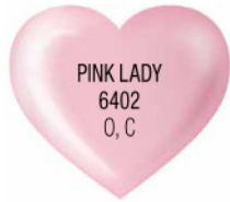
Creamy bright pink