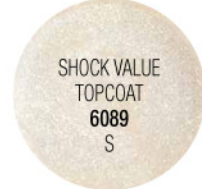
Shimmer over glaze topcoat