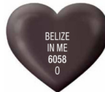
Dark gray with brown undertone