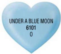
Creamy pastel blue