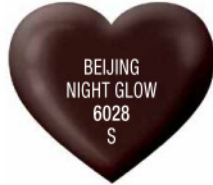
Burgundy with red shimmer