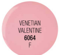
French pink for complementing clients skin tone