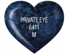
Deep blue with silver metallic