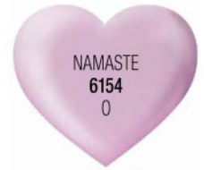
A baby pink