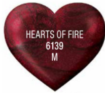
Deep red metallic