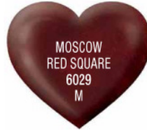
Deep metallic red