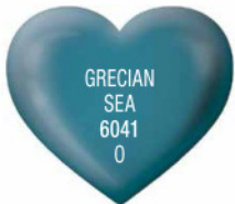
Dark aqua blue-green