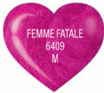
Iridescent fuchsia metallic