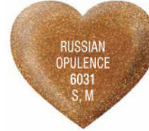
Metallic gold with shimmer