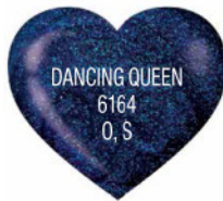
Royal midnight blue with gold shimmer