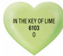
Bright lime green