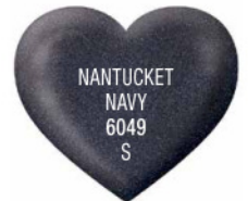
Navy with blue shimmer