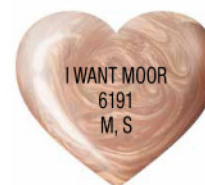
Pink with metallic gold shimmer