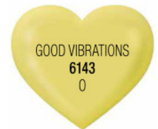
Soft, butter yellow