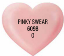
Creamy pastel pink