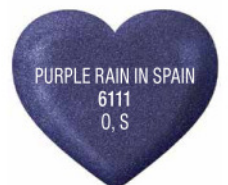
Deep purple with fine crystalline shimmer