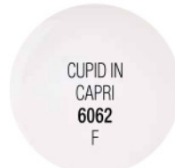
Soft French white

COLLECTION CLASSIC, FRENCH MANICURE SHADES