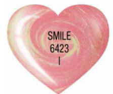
Iridescent pink / coral