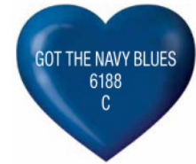
Deep Ink Blue