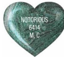
Green with silver metallic