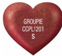
Warm red shimmer