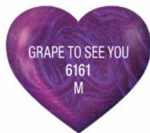
High-powered metallic purple