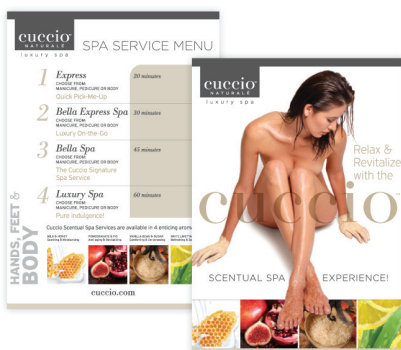
Counter Tent Card